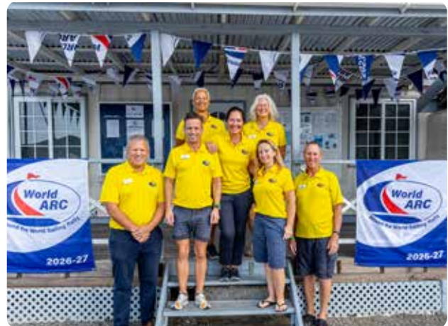
The team for World ARC 2026-27 in Saint Lucia

Includes rally communications at sea, key passage planning notes, essential weather forecast information and ways to receive weather information. In addition, there is information on the fun competition.