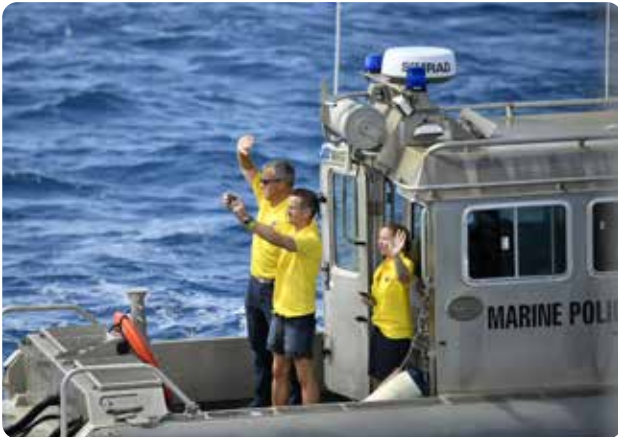
The 2026-27 World ARC Team wave goodbye to the fleet in Saint Lucia

The World Cruising Club has been organising rallies since 1986. Since then, more than 7,000 boats from scores of countries have taken part in our events, looked after by our dedicated teams in every port en route. Our rally organisation ensures that participants are prepared for the voyage and supported on their adventure.